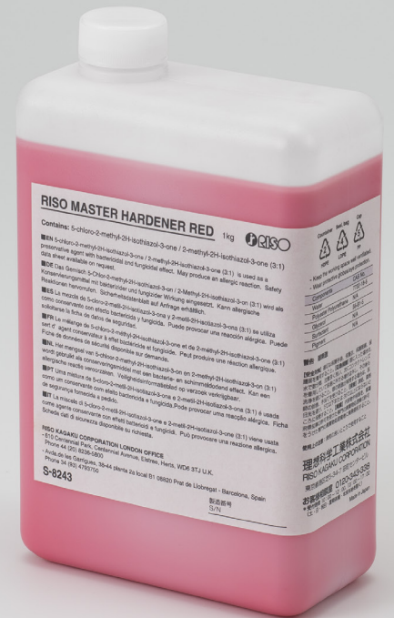
S-8243 1kg(litter)/bottle (A quarter Gal.)